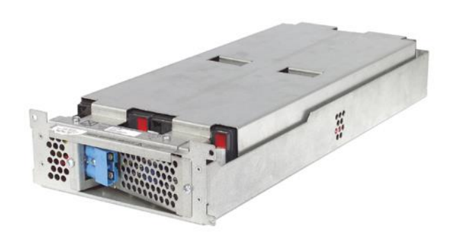
RBC115, RBC116 RBC117