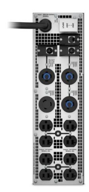
SURT Units (All SURT unit models except: SURT003, SURT005 and battery packs beginning with "SURT192")