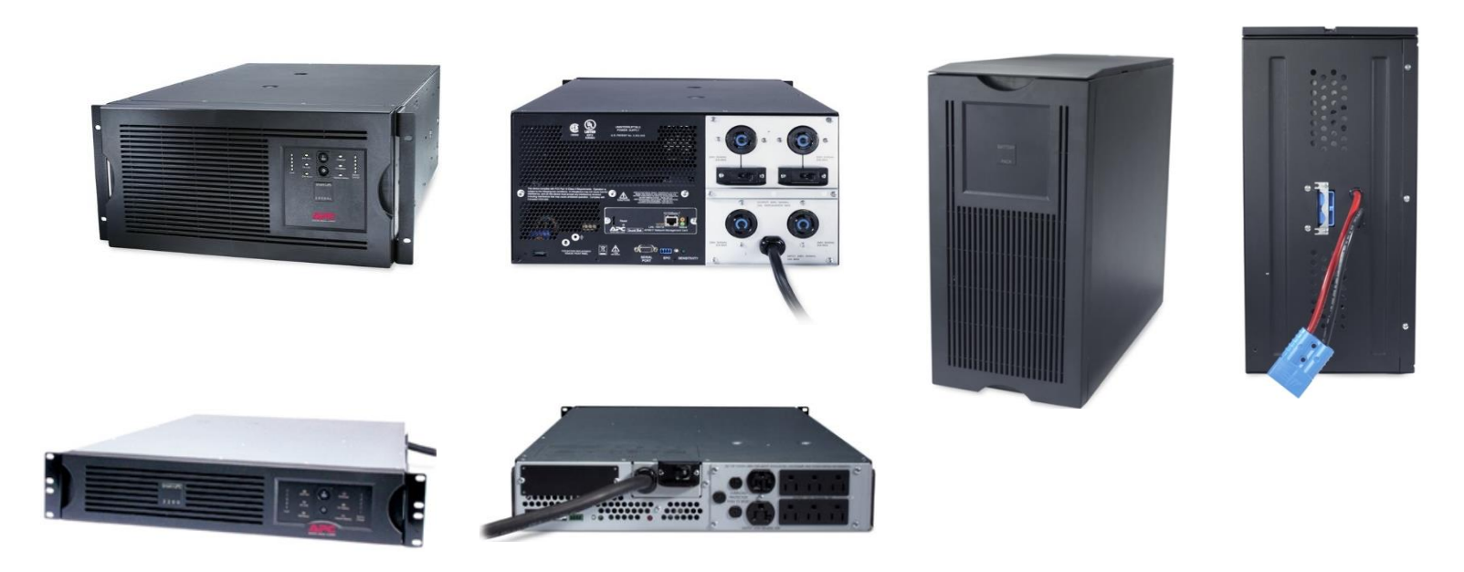
SMT Units and Battery Packs (All SMT models except: SMT750/SMT750C)