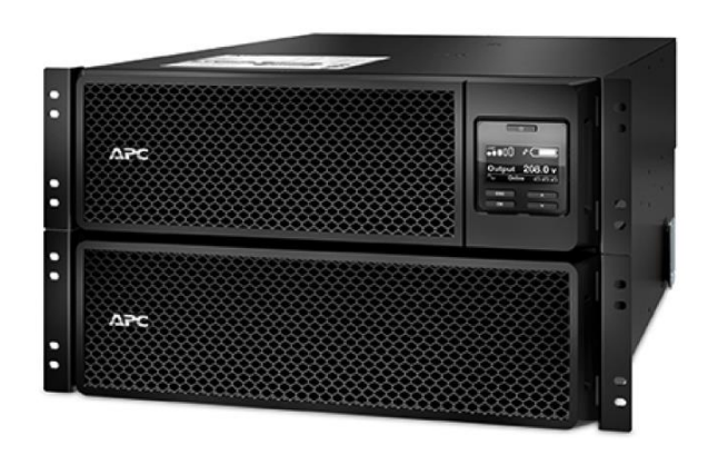
SRT Battery Packs (All SRT models accepted)